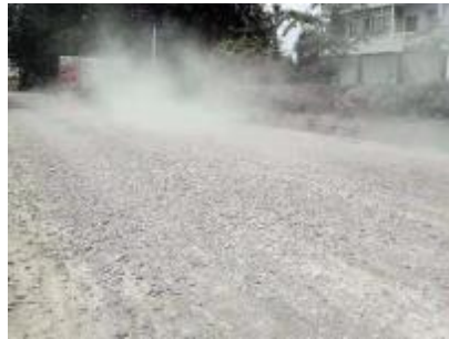
Dust and particles