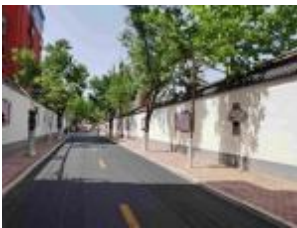
Back Streets & Lanes