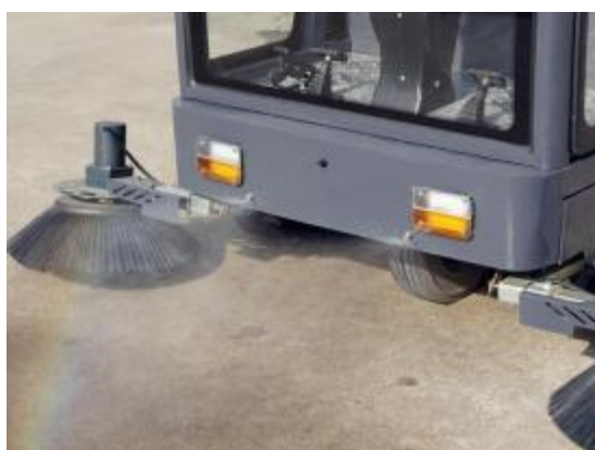
Water spray for dust suppression