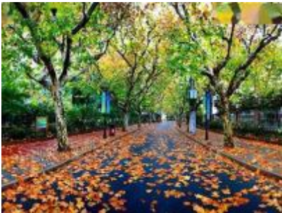
Road fallen leaves