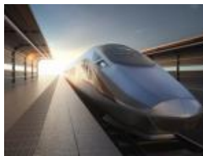
High-speed Rail Stations & Airports