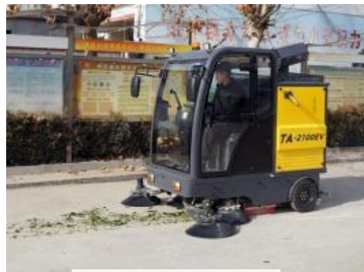
Clear fallen leaves