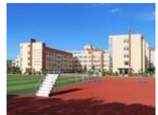
Schools & Hospitals