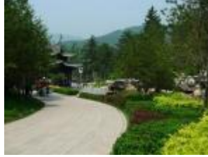
Parks & Scenic Spots