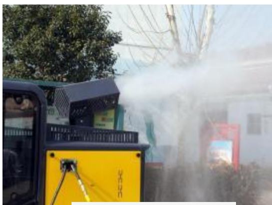
Fog spray irrigation